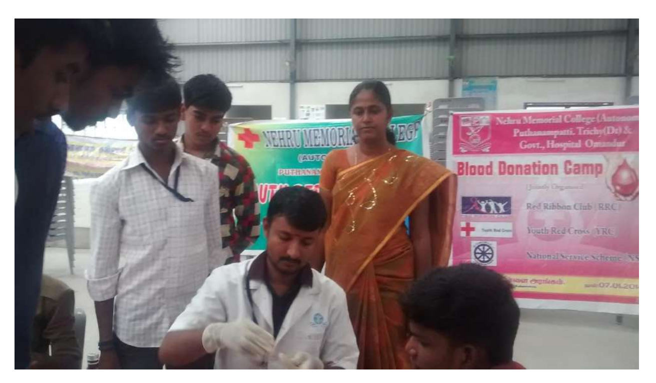
YRC Orientation Programme